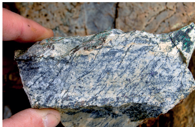
Bornite along bedding and axial plane cleavage in dolomite, Alta

By correlation with Cu-deposits in the Sylarna area in Sweden, close to the border with Norway, a potential for SSC in the Norwegian Caledonides may also exist.