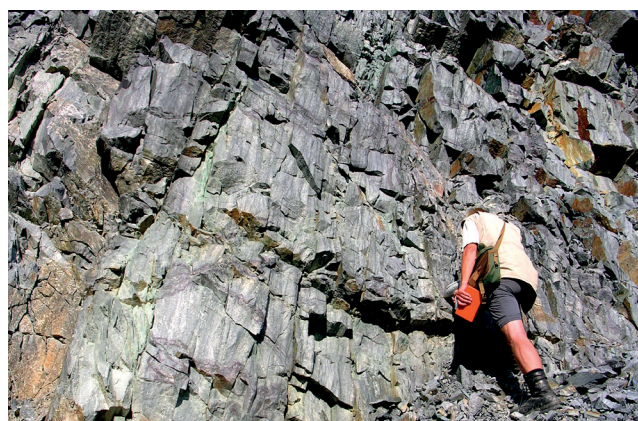
West pit at Ulveryggen