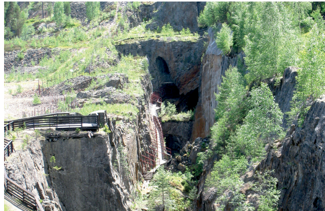
Open pit in the abandoned Skuterud Cu-Co deposit