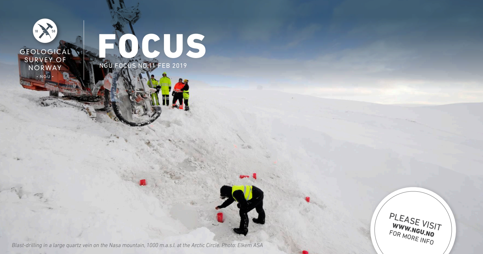
Blast-drilling in a large quartz vein on the Nasa mountain, 1000 m.a.s.l. at the Arctic Circle.