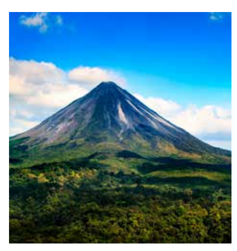
Two natural phenomena will always impact your life if living in Costa Rica; earthquakes and volcanoes

Age: 35 Leisure activities: Swimming, running, cycling, reading Education: PhD from the University of Alberta, Canada NGU: Geochemistry and Hydrogeology Team