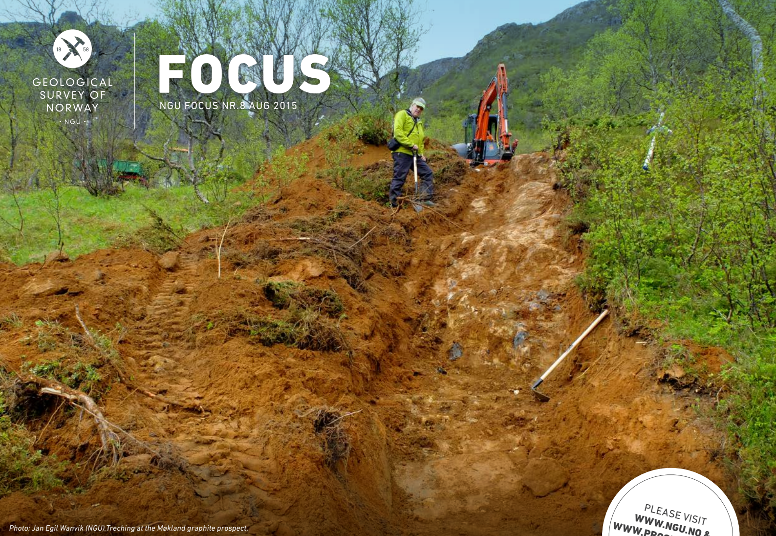
Treching at the Møkland graphite prospect.

PLEASE VISIT WWW.NGU.NO & WWW.PROSPECTING.NO FOR ADDITIONAL INFORMATION