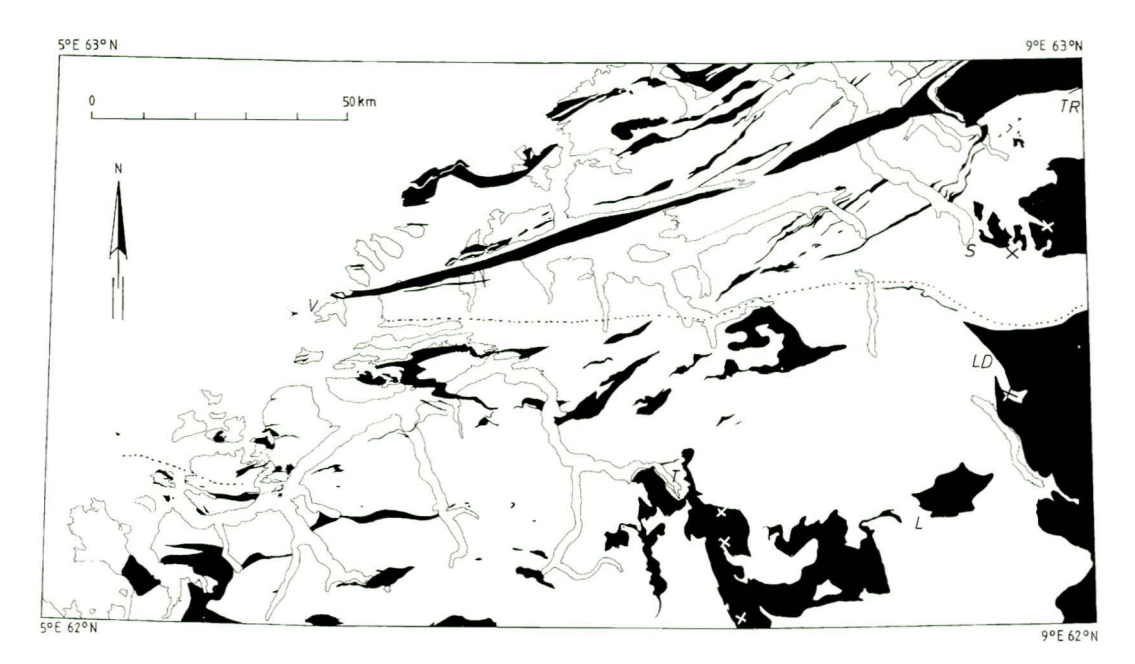
Fig. 1. The area covered by the two 1:250,000 scale map-sheets Ålesund and Ulsteinvik. The figure shows (in black) rocks with characteristics similar to the allochthonous units in the Trollheimen - Oppdal area. 'Basement' in white. See text for details about separation of the two categories. Localities where quartz pebble conglomerate is observed are marked with x. Some of the locations mentioned in the text are marked by capital letters: Grotli G, Lesja L, Litjdalen LD, Sunndalsøra S, Tafjord T, Trollheimen TR, Vigra V. Oppdal is located 50 km east of Sunndalsøra, outside the map area.

In addition to this study, two other mapping projects with a similar basic methodology have been reported. These include mapping of the Trollheimen tectonostratigraphic sequence as far west as Vigra (Robinson & Krill in press), and the linking of the partly supracrustal Vikvatnet unit at Tafjord (Brueckner 1977) with metasupracrustals at Lesjaskog (Santarelli 1989). The present study incorporates information from these earlier regional studies.