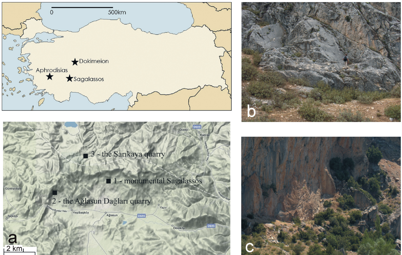
Figure 1. (a) Outline of the central part of the territory of Sagalassos in southwestern Turkey (the modern-day village of Ağlasun is indicated). Main quarry locations are 1: monumental Sagalassos, 2: the Ağlasun Dağları quarry, 3: the Sarıkaya quarry. (b) The northern/western quarries near Sagalassos, next to the stadium. (c) The quarry face and spoil heaps at Sarıkaya, triangular quarry face is 30 m high.

from just outside the southwestern territory of the town, along with the high-quality white limestone. This import can be considered a trend from the Trajanic Period (AD 98–117) onwards, at the same time as Pamphylian monuments gave up the high-quality Pisidian limestone of the 1 st century AD in favour of the now massively imported cheap white (and grey veined) Proconnesian building marbles. Yet, this cheap stone never seems to have reached the Sagalassian construction sites. A keyword for quarrying the local limestone in the city area seems to be proximity. In the immediate vicinity of important stone-consuming activities, there are quarries which in size fit the required volumes. This view is also supported by the integration of possible quarries in buildings, where the (older) quarry walls or steps are used as an integral part of a (new) construction. Another interesting aspect of the quarries is the lack of well-organised quarries and systematic channelling typical of the Greek and Roman Periods. This relates