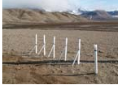
Kaffiøyra field site, Svalbard