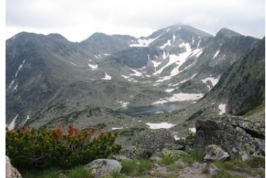
Musala field site, Bulgaria