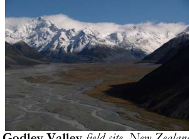
Godley Valley field site, New Zealand