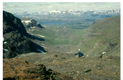
Kärkevagge field site, Sweden